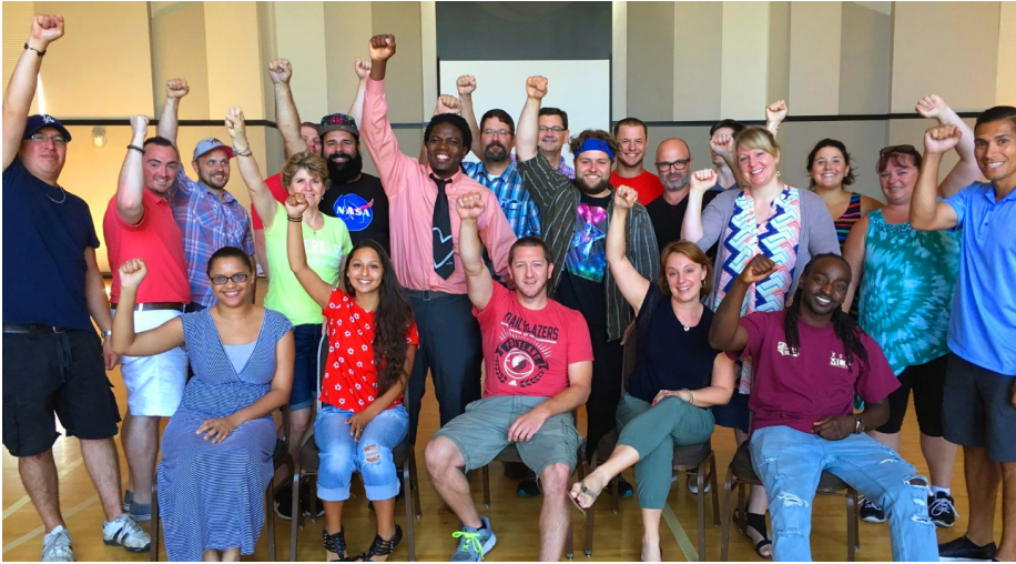
Attendees of The Council for Boys and Young Men Facilitator Training in Corvallis, OR, 2016

One Circle Foundation trainings are approved by the National Association of Social Workers, the California Board of Behavioral Sciences – CEPA, the Ohio CSWMFTB, for CE's for MFT's, LCSW's, LPCC's, LEP's, social workers and correctional staff. Please visit our website for updates on CE's: www.onecirclefoundation.org/accreditation