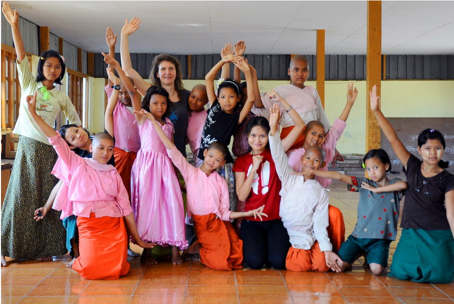
Girls Circle® in Burma – Adolescent Girls Violence Prevention and Girls Advisory Board