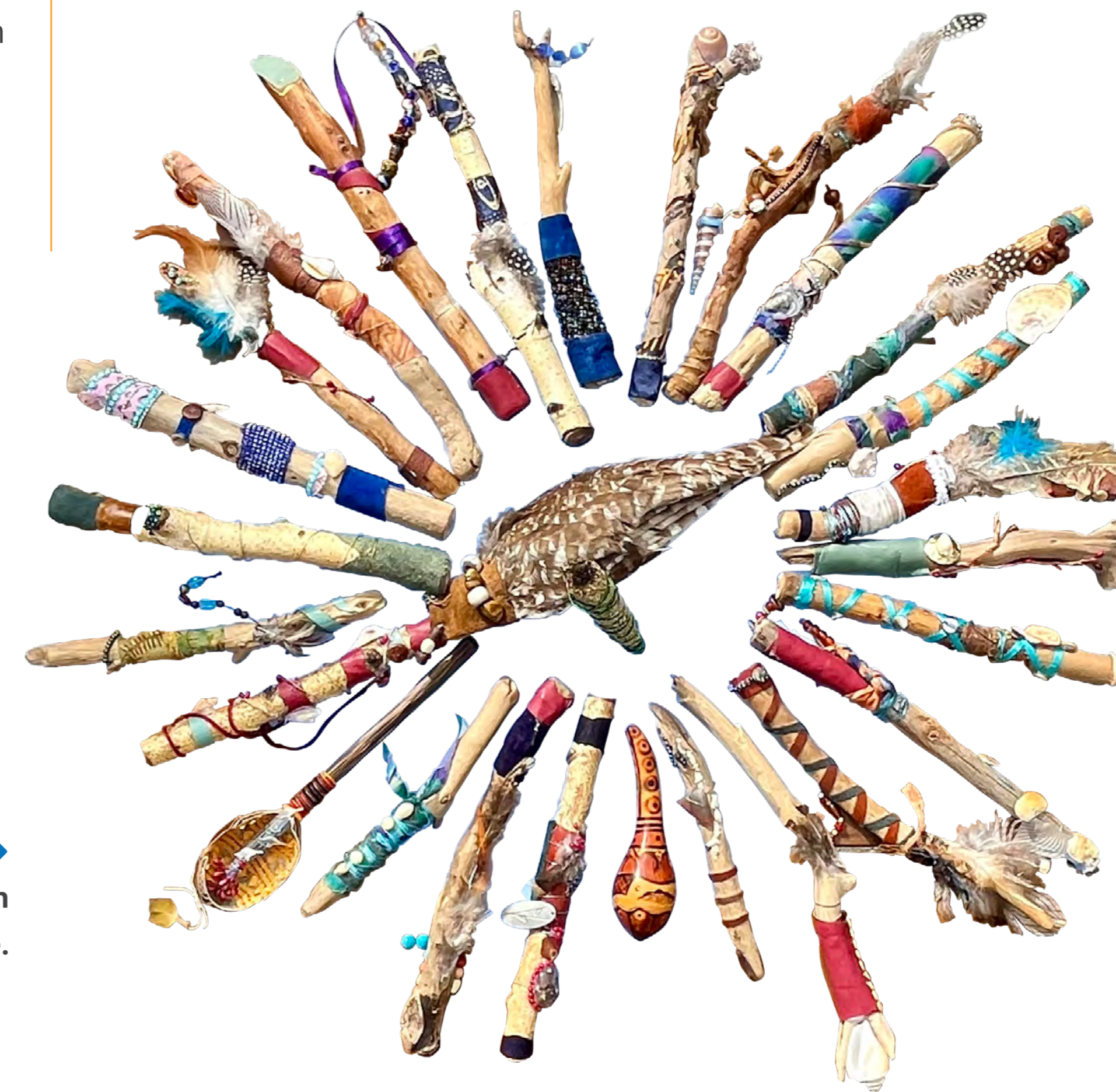
TALKING PIECES ▶ Hand-made by staff and used at our in-person trainings during the Circle experience.